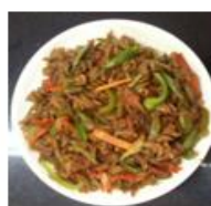
Beetroot leaf pasta