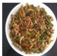
Radish leaf pasta