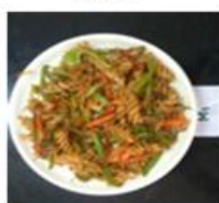
Carrot leafy pasta